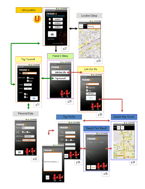
Figure 1. Snapshots of the FriendU System

The FriendU system is composed of client agents on the hand-held devices and the server side components. Figure 1 shows the GUI snapshots of submitting a query of interest from a mobile device, and getting the answers back from the server. The answers are consisted of object identifications as well as the location information of each object. Client Agents will display the results on the Google Map based on the location information.