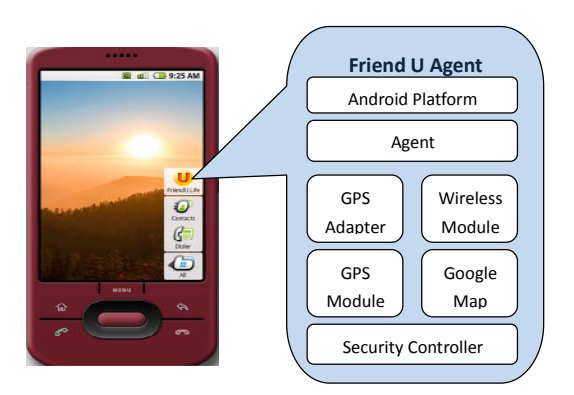
Figure 3. The FriendU Client Components